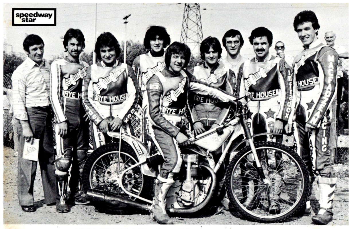
RYE HOUSE National League Champions